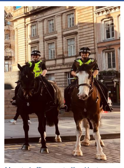
Mounted officers patrolling Hunter Square and Nicholson Square with Community Officers

The Old Town area continues to be challenged with the issues of vulnerable drug users, specifically in the Hunter Square area. The Wellbeing Wednesday initiative will restart in the winter months and is to be extended for additional days throughout the week. The initiative was set up by Streetworks working closely with Police Scotland and Edinburgh Health & Social Care Partnership. The physical landscape of Hunter Square is also being discussed at elected representative level within City of Edinburgh Council following a recent meeting with local businesses and retailers and comments from a prior Environmental Visual Audit from Police Scotland. Operation Taupe continues with enhanced presence in the area to offer reassurance to the businesses and community. Whilst vulnerability exists with persons attending the area, enforcement will continue with Old Town Exclusion Orders being requested.